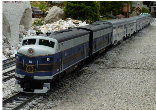
B&O Passenger train we observed last year on the Club's annual Four Club Tour to Columbus, Ohio. This year we will visit the Dayton, Ohio's Miami Valley Garden Railway Society Four Club Tour in August.

Indiana Large Scale Railroaders 1214 Morningside Drive Lebanon, IN. 46052