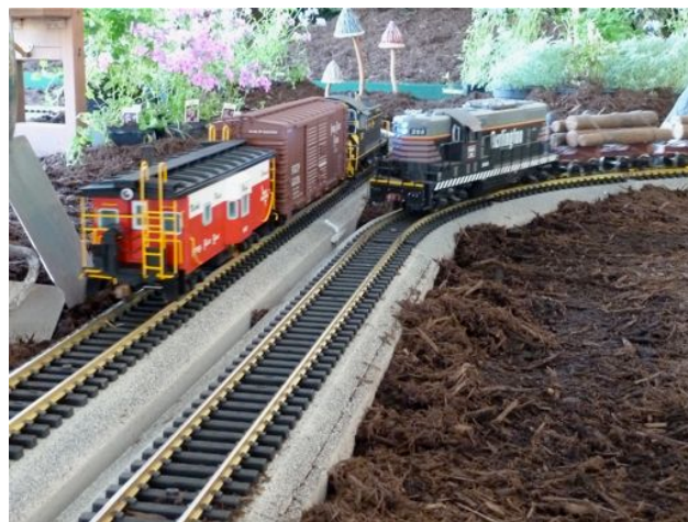
Train Meet; Notice the sub-road bed.