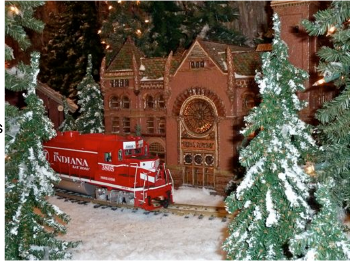
Jingle Rails display at the Eiteljorg Museum. Train is passing in front of famed Indianapolis Union Station.