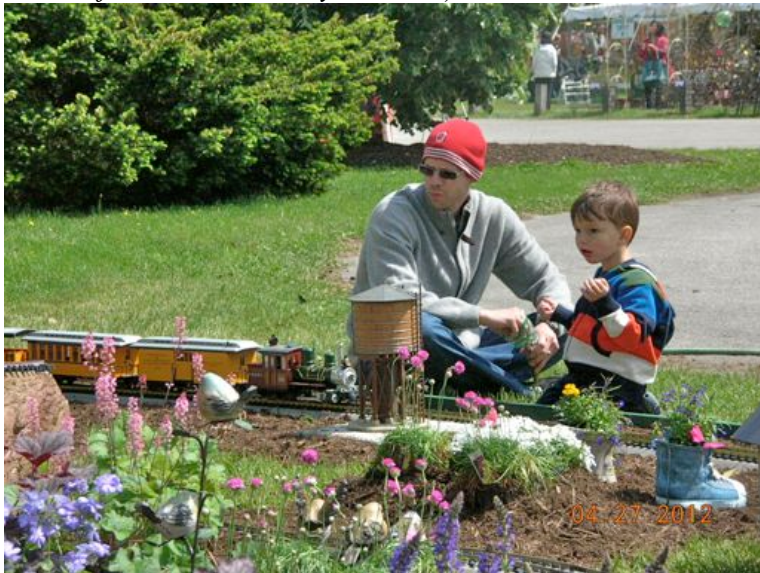
A Dad and his Son sat down to "set for a spell" and to admire the beautiful Large Scale Trains in operation.