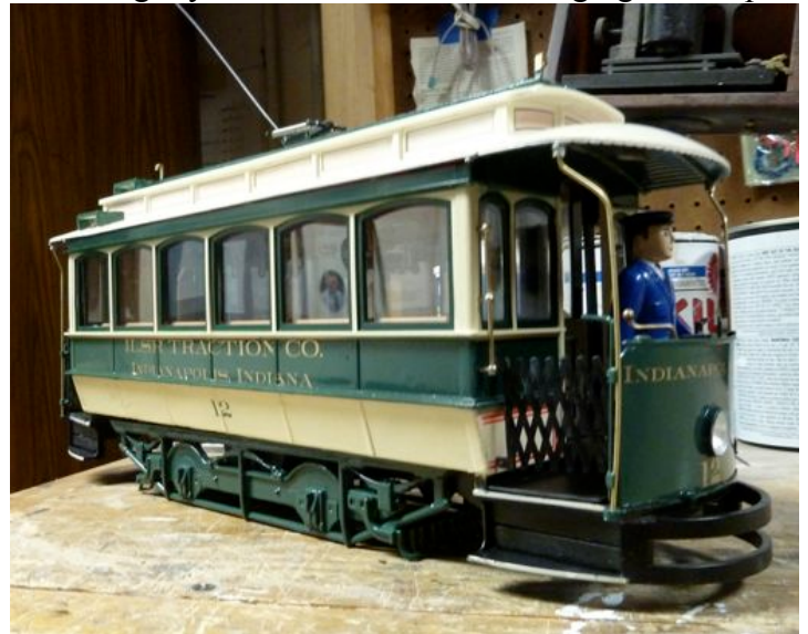
Close-up shot of the custom painted green & ivory ILSR Traction Co. / Indianapolis, Indiana Trolley.