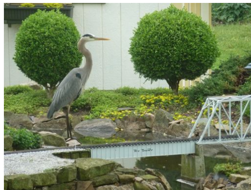
"SECURITY CAMERA" CAUGHT THIS "BLUE HERON" FISHING ON BUD'S RAILROAD (HE HAD TWO FISH FOR 9:00 BREAKFAST)