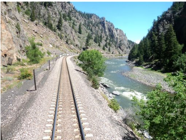
Looking out the rear door of our “sleeper car” while traveling thru Colorado.