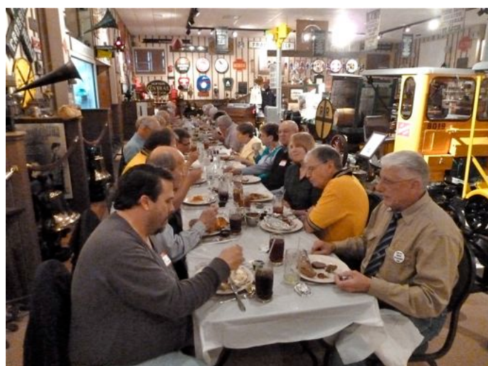
Some eating places have great food; Some have great atmosphere. Here, we truly had both !