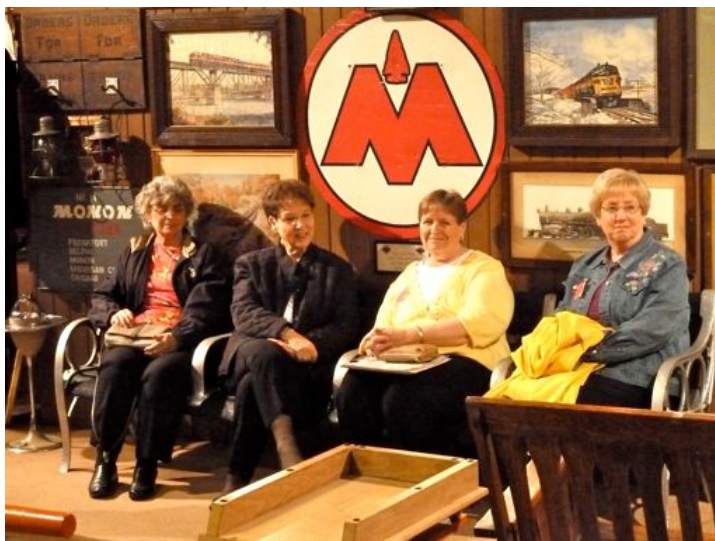
If some of our wives got tired of “walking and looking”, there were ample RR benches to “sit and rest for a spell”.