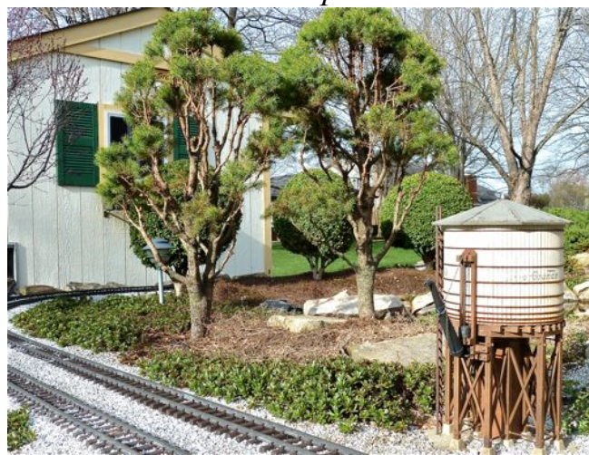
(Couple of days after)