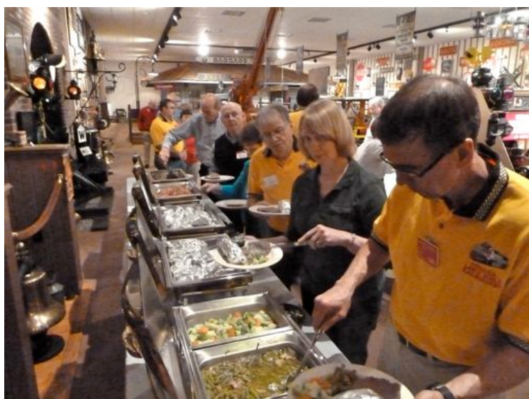
The “Pot Roast” & “Ham Steak” buffet was a First Class Dinner for all.