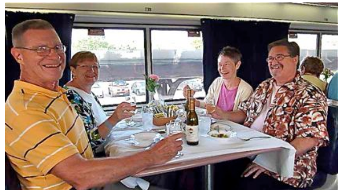
“Dinner on the Diner” (somewhere in Iowa)