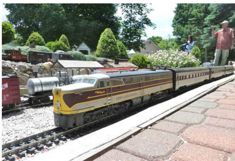
We are looking at the “back side” of the layout and everyone will notice that this RR is built to operate 3 trains simultaneously. We see the Forney freight on the mountain track, the Norfolk Southern freight on the passing track and the Erie-Lackawanna passenger on the outside mainline.