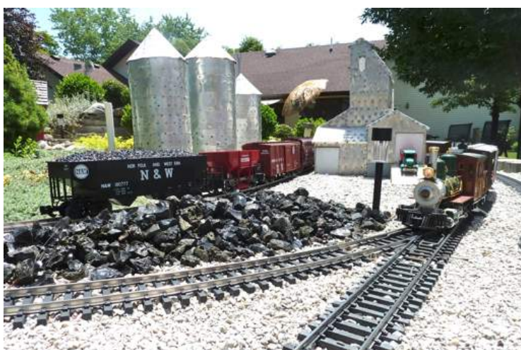
A grain elevator is visible in the background with coal sales yard standing in the foreground. (The coal is real!)