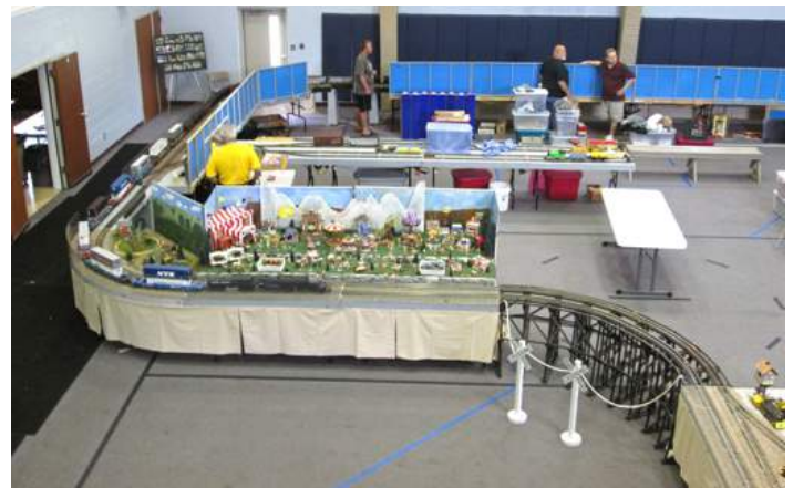
Our Modular Division club members really have developed an impressive, crowd pleasing, G Scale layout. (note the curved trestle bridge on right)

Two videos of these operations are showing on our Club website. Most of you have probably already seen them by this time, but in case you haven't yet, be sure to do so. They are worth seeing more than just once! - photos below by Jacquie Banks